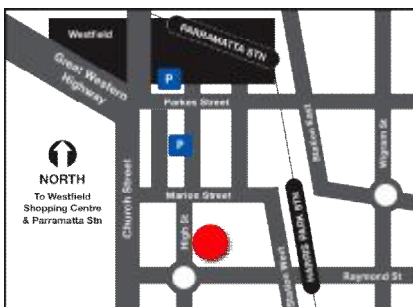
PARRAMATTA 57 - 59 High Street Harris Park NSW 2150 Tel: (02) 9687 7203

Located in the building above Dymocks book shop next door to Myer